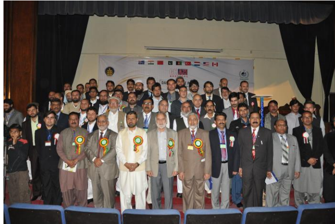
Senior Minister Khyber Pakhtunkhwa Mr Inayatullah Khan chaired the inaugural session